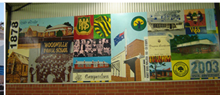
4. Woodville Primary School