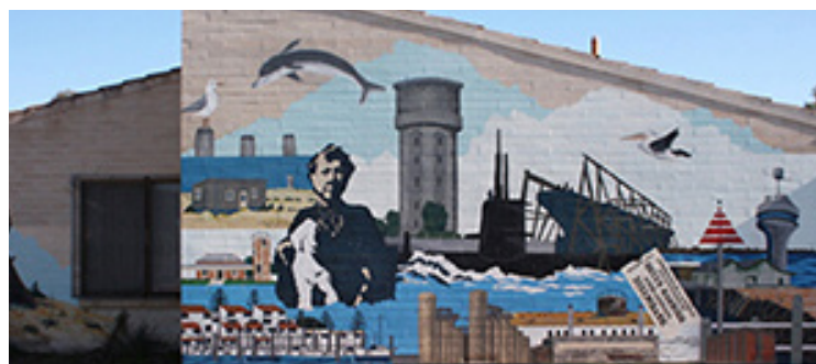
3. North Haven Primary School