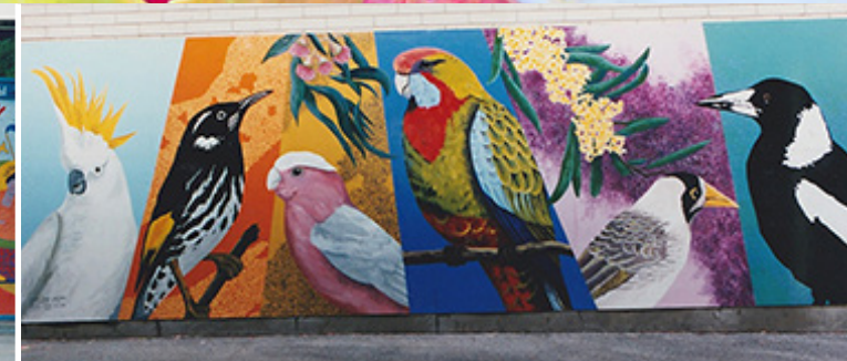
2. Marden Birds