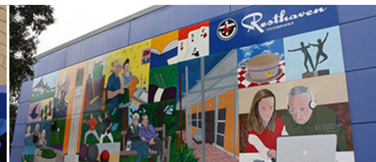
6. Resthaven Office, Elizabeth